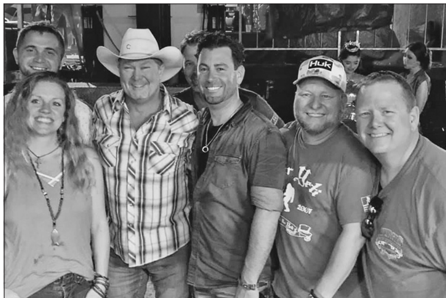
The Feudin' Hillbillies