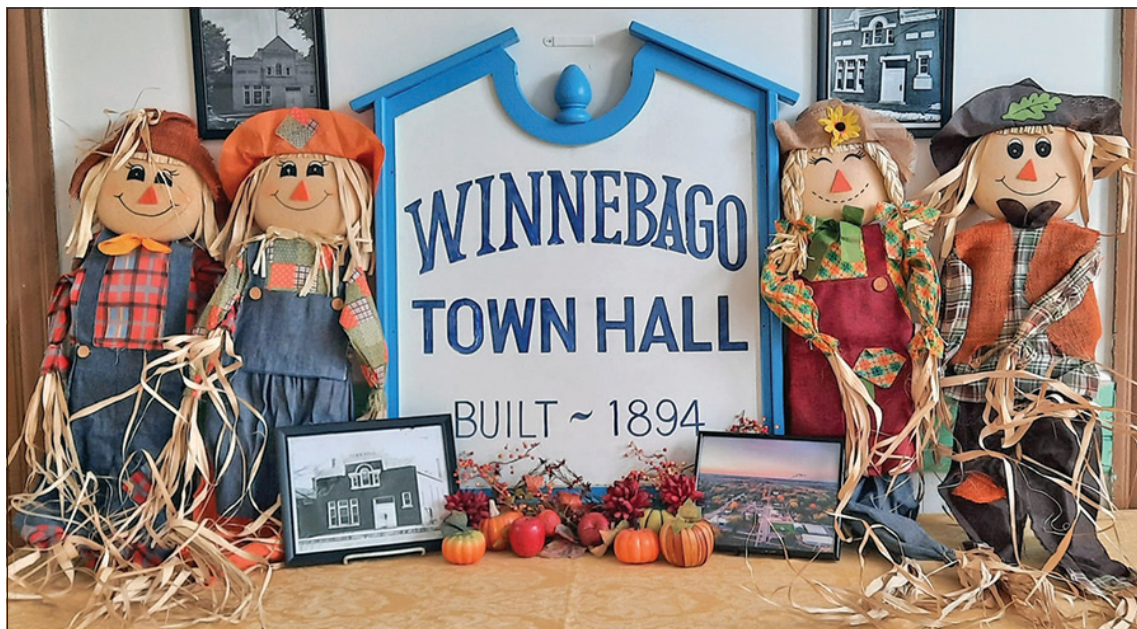
Close to Home

The Winnebago Town Hall at 116 S. Benton St. was built by the Trustees of Winnebago Township and dedicated in December 1893. The building was home to a wide variety of activities through the years and served as the meeting place and office for Winnebago Township officials. In 2018, the Winnebago Community Historical Society assumed ownership of the building and adjacent garden.