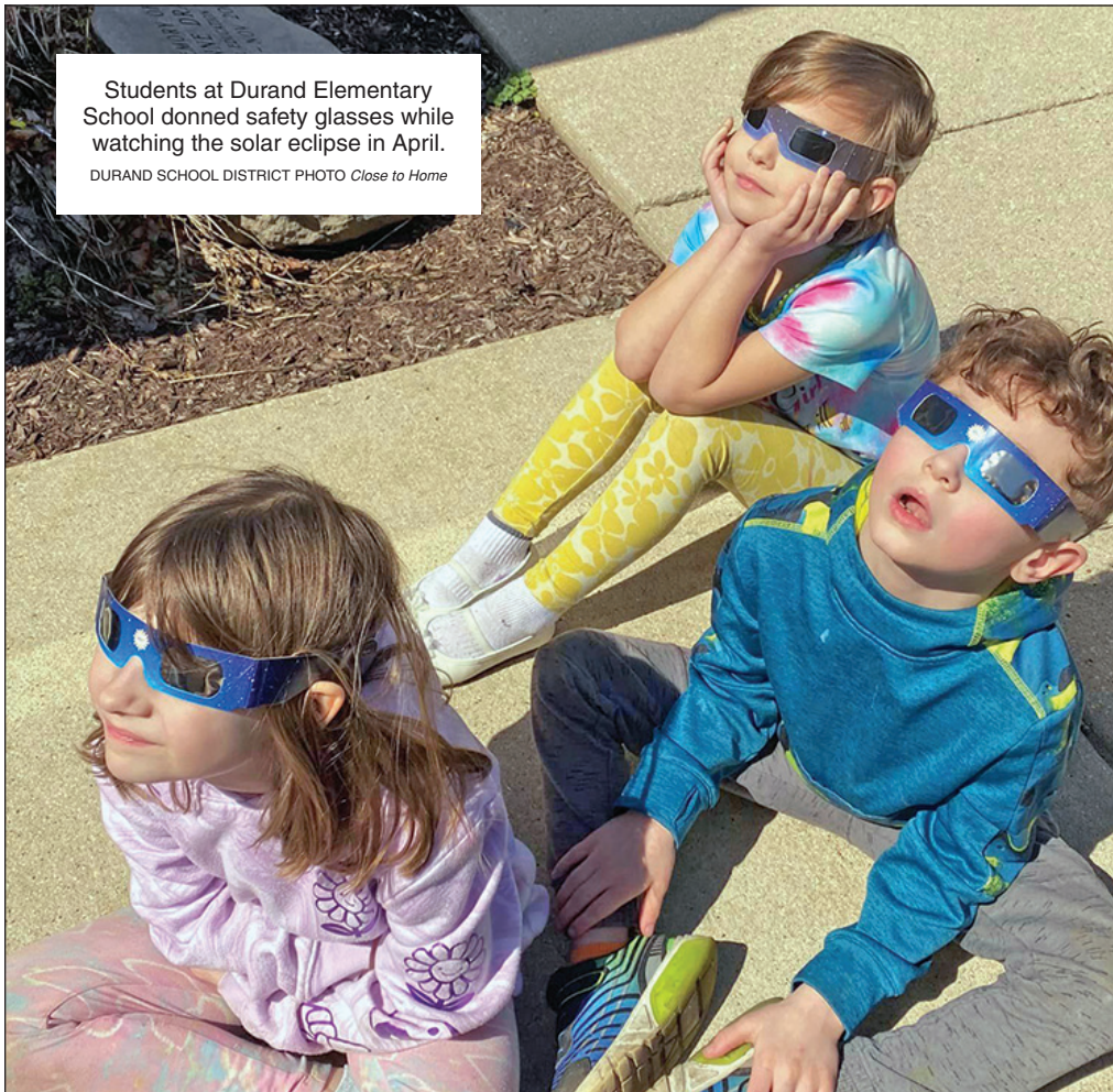
Students at Durand Elementary School donned safety glasses while watching the solar eclipse in April.

Principal: Cara Pirrie 10104 Farm School Road 815-599-3975