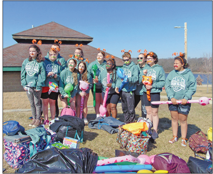
top: The Du-Pec football team proudly plunged again this year at the 2024 Polar Plunge on March 2, held at Olson Lake in Rock Cut State Park in support of the Special Olympics. above: A team from Winnebago High School had fun preparing to take the plunge, adding humor with the use of props. All together, the Rockford region's Polar Plunge raised a total of $100,000, surpassing their goal of $75,000.