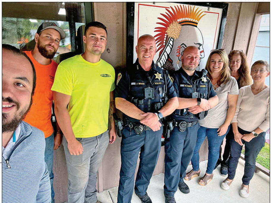
VILLAGE OF WINNEBAGO PHOTO Close to Home