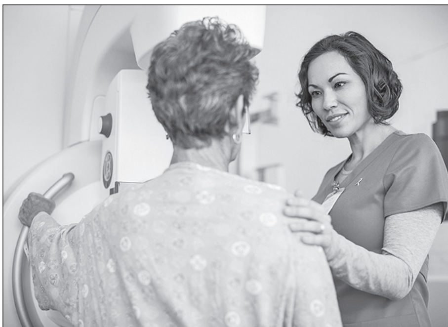
There are several different types of breast cancer from invasive ductal carcinoma – the most common type, to metastatic – which originates in the breast but has spread to another part of the body.

Invasive ductal carcinoma accounts for 70 to 80 percent of all breast cancer diagnoses in women and men. This