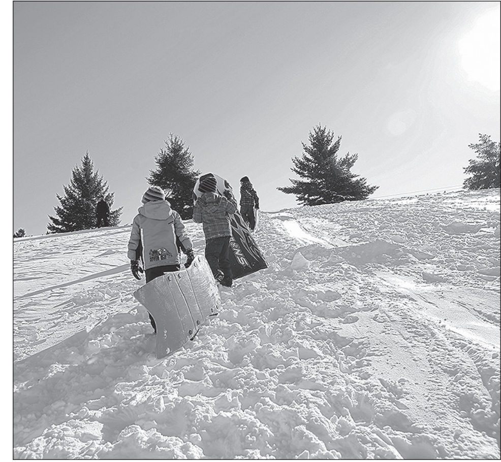
Children who are not physically fit are at greater risk for chronic diseases but there are several ways to help them find the fun in exercise and physical activities. Health & Fitness

Kids need physical activity to stay healthy, and there are various ways to make them more inclined to be active.