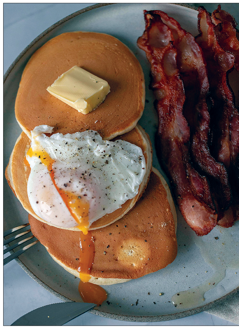
Bacon is high in cholesterol and saturated fat. It's one of numerous popular food choices that should be avoided or at the least, eaten in moderation.

Certain foods like bacon and red meat are hard to resist. However, those who want to preserve their heart health are advised to eschew these fan favorites and replace them with alternatives that help to lower their risk for cardiovascular disease.