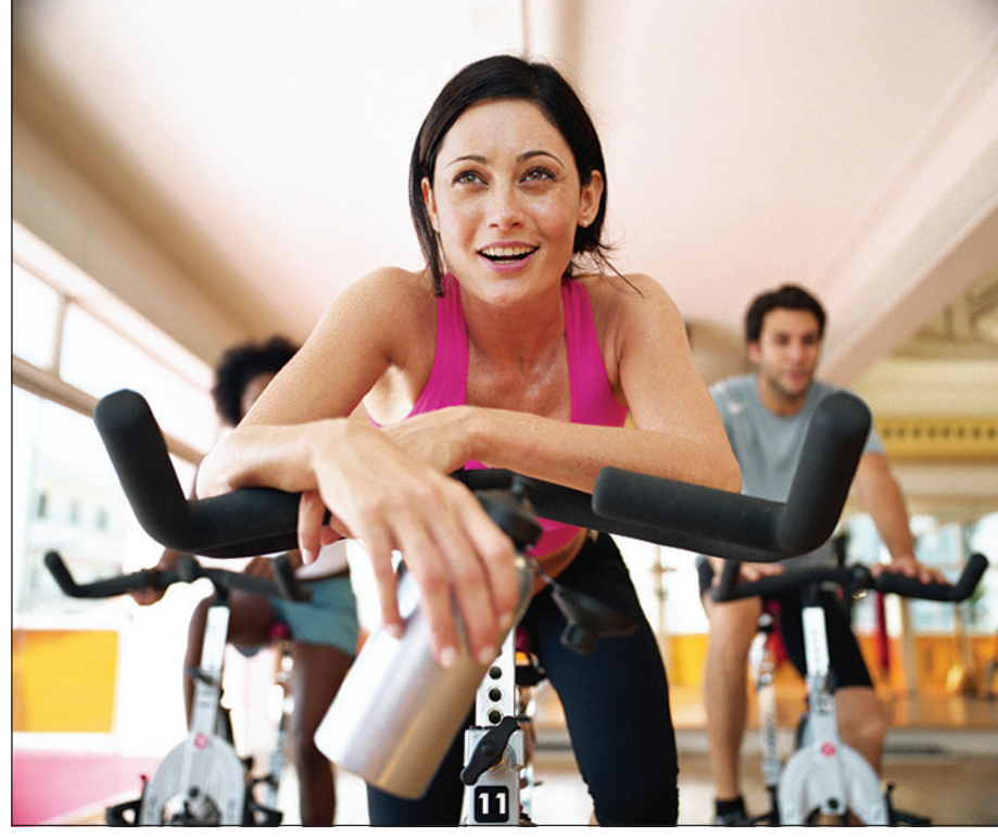
As people find – or make – more time for exercise, they may be drawn to the various classes available that can help them meet their exercise goals. This is the perfect time of year to give some new classes a try.

The classes may be low-intensity or vigorous, depending on the instructor.