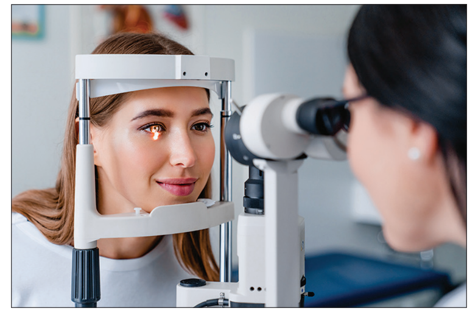
Despite the significance of eye exams, many people do not visit an eye doctor until something is amiss with their vision or eyes. If people know what to expect they may decide to schedule an exam. METRO CREATIVE PHOTO Health & Fitness

time they step into a private eye doctor's office or a vision center, courtesy of The Cleveland Clinic and Warby Parker.