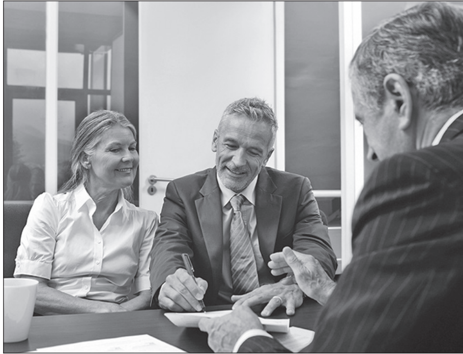
Financial planning for retirement is often emphasized to young professionals beginning their careers. But it's equally important that people on the cusp of retirement continue to look for ways to protect and grow their wealth.