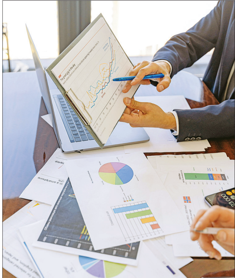
The SEC's Office of Investor Education and Advocacy has compiled a list of tips to help consumers make better informed investment decisions and avoid common scams in 2025.

Investing in Your Future