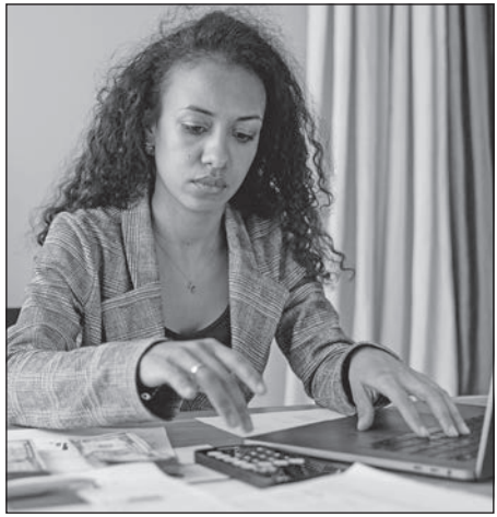
Clear goals provide motivation and direction for financial choices.

Begin by defining specific financial goals, like building an emergency fund, paying off debt, or saving for a vacation or retirement.