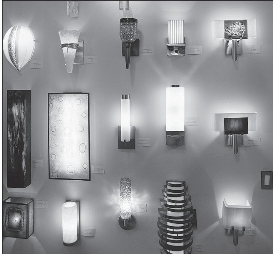
Lighting is an important part of any design. Homes & Design