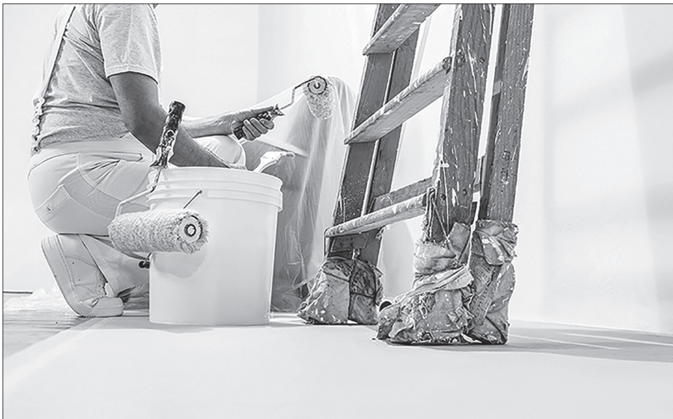
A fresh coat of paint can produce amazing results. Leaving the work to a professional can ensure a job is done correctly and beautifully and completed on time.

Do-it-yourselfers may need to buy new tools before beginning the job. This means brushes, rollers, tape, tarps, trays,