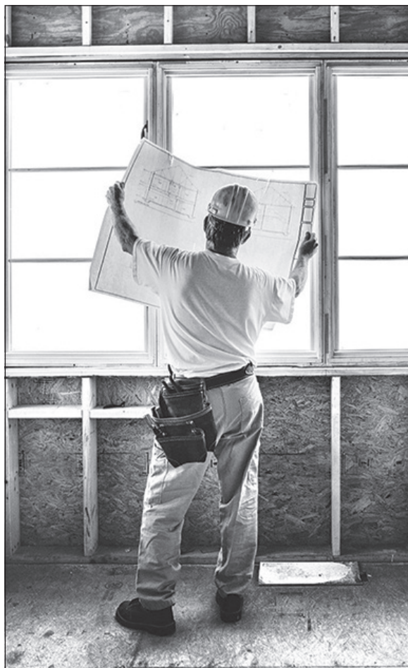
A recent report found that the average time spent planning a kitchen renovation in 2023 was 9.6 months, while the building took just over five months. Additional projects featured a similar disparity between the time to plan and the time to build. top: Homeowners spent almost twice as much time planning their kitchen renovations in 2023 as it took for the projects to be completed. Kitchen remodels for example can take anywhere from six to 12 weeks.

Remodeling a home often involves a considerable investment of time and money. Knowing how long a homeowner will be inconvenienced by the work can help the household plan accordingly.