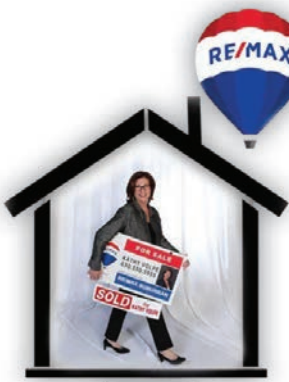
"I have you covered!"