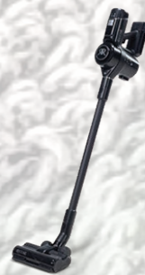
Riccar R65 Cordless Stick