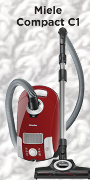
Miele Compact C1