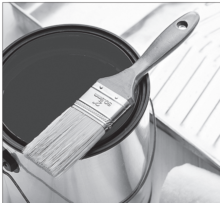
A fresh coat of paint can produce amazing results. Leaving the work to a professional can ensure a job is done correctly and beautifully and completed on time.