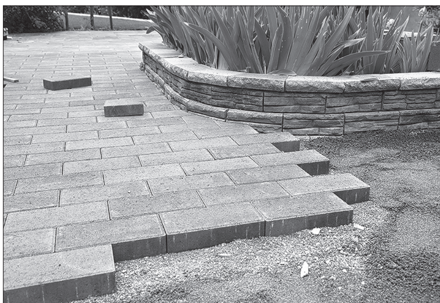
Homeowners planning outdoor living space projects may find themselves choosing between a deck and pavers. Each option can work, and homeowners may even want to combine the two.

For example, composite decking materials tend to cost significantly more than wood decks, but that higher price tag also comes with less maintenance and