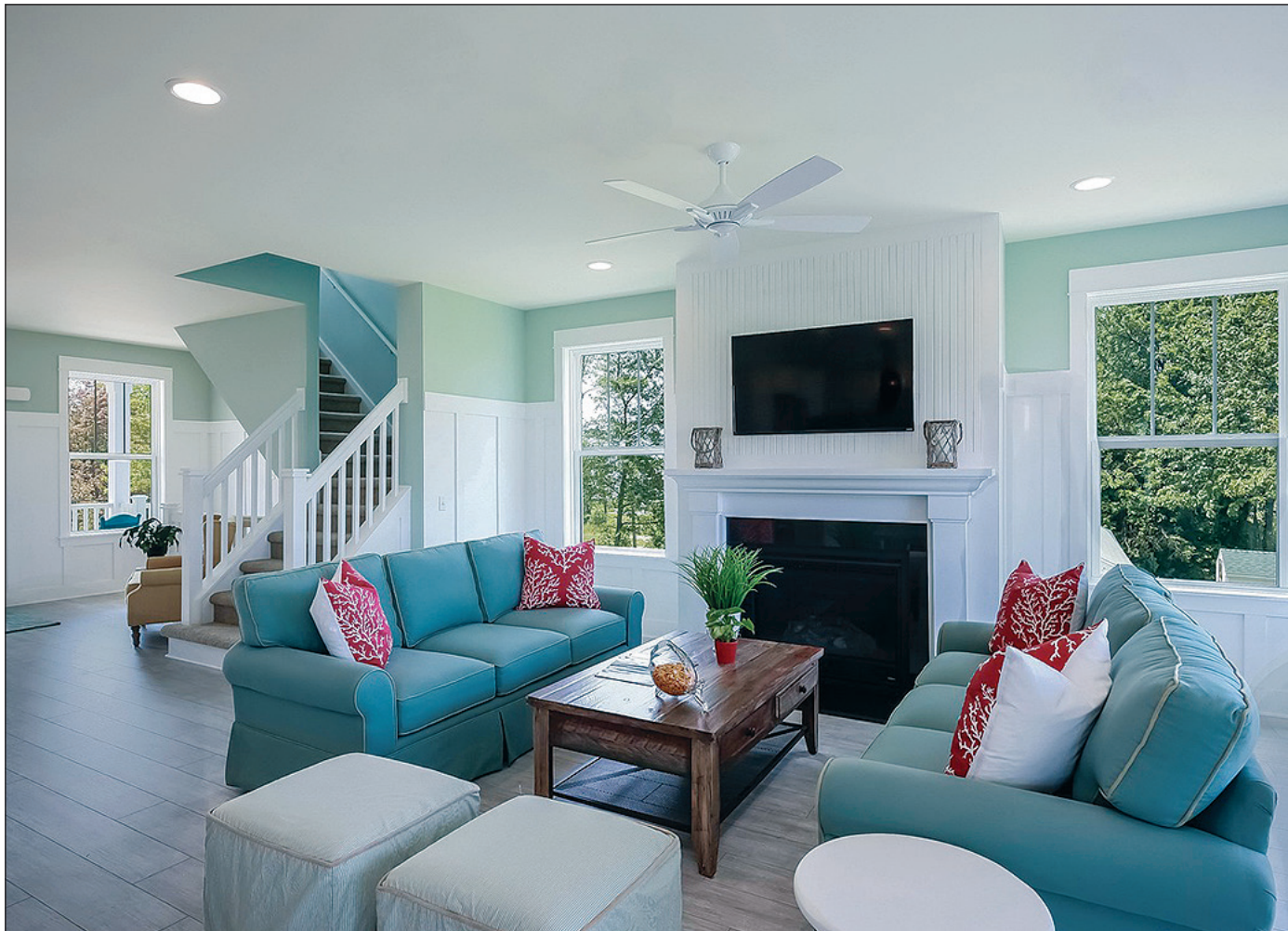
Homes & Design