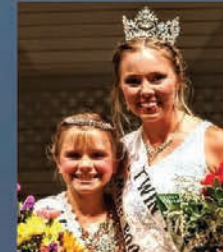
Queen Pageant Tuesday