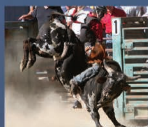
Pro Bull Riding Friday