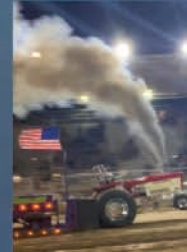
Truck & Tractor Pulls Thursday