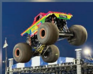
Monster Trucks Wednesday