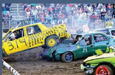
Demolition Derbies Sunday