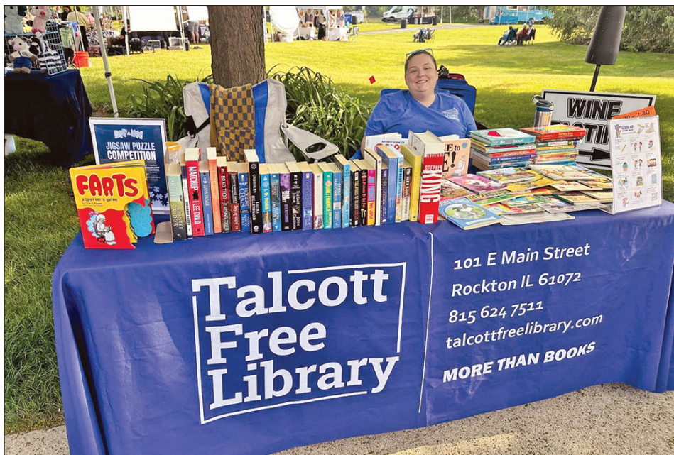
Stop by and pick up a book or two from the Talcott Free Library's kiosk at Rockton River Market this summer.