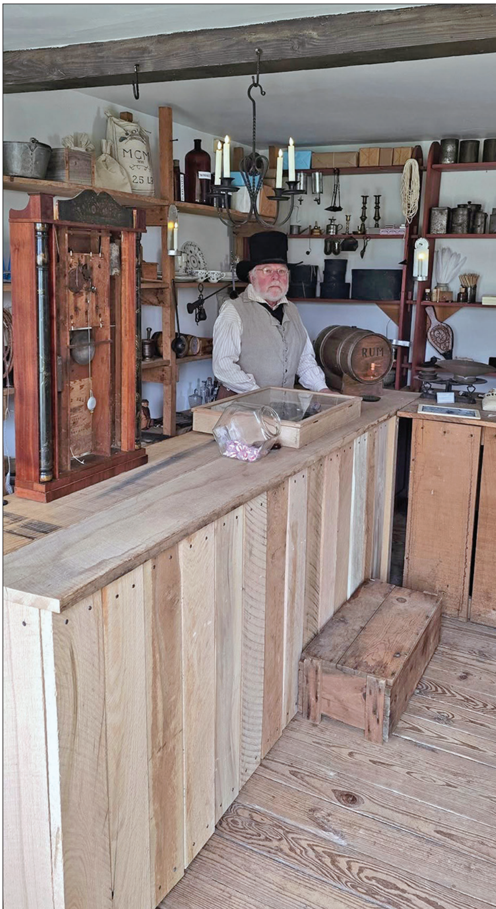
Macktown Living History volunteers gathered for a photo at a volunteers social event on June 8.