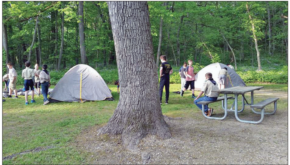
Hononegah Forest Preserve is celebrating 100 years of providing recreation for families and organizations. Shown here are boy scouts from Troop 620 out of Roscoe.

The Rockton Athletic Fields feature multiple baseball games throughout the summer. The athletic fields will feature six baseball diamonds, six soccer fields, a football field, a concession area, a playground, a two-mile walking path and a skate park.