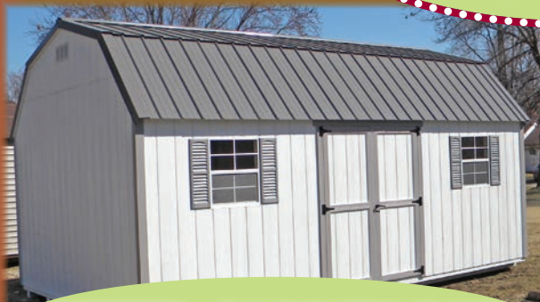
LOFTED GARDEN BARN

Mention this ad & receive a $50 DISCOUNT on any order!